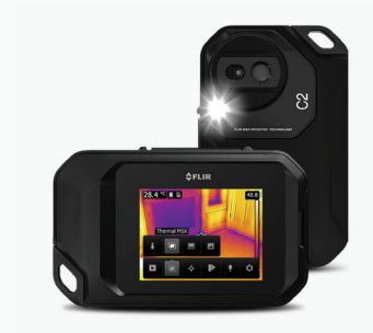
FLIR Thermal Camera C2